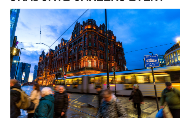
KIMPTON CLOCKTOWER HOTEL