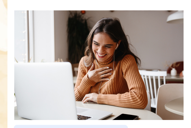
ON OUR VIRTUAL PLATFORM