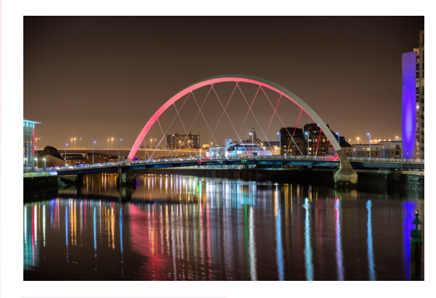
RADISSON BLU HOTEL