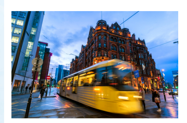
THE BRIDGEWATER HALL