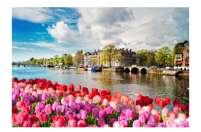
HÔTEL MÖVENPICK AMSTERDAM CITY CENTRE