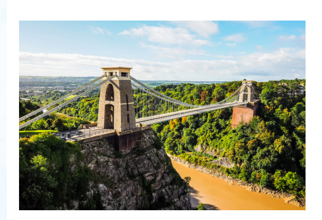
WE THE CURIOUS

Tuesday 21st October 2025 250 ANTICIPATED ATTENDEES 500 ANTICIPATED SIGN UPS